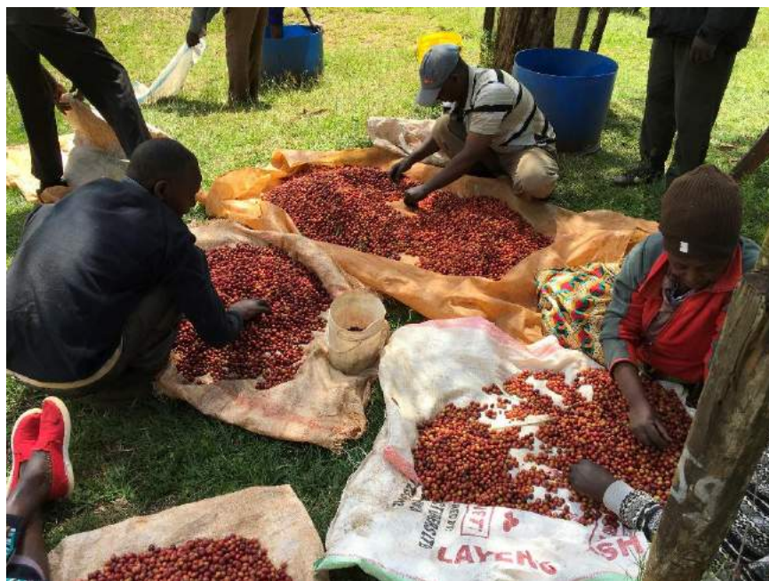
Smallholder farmers sorting ripe berries to remove elements