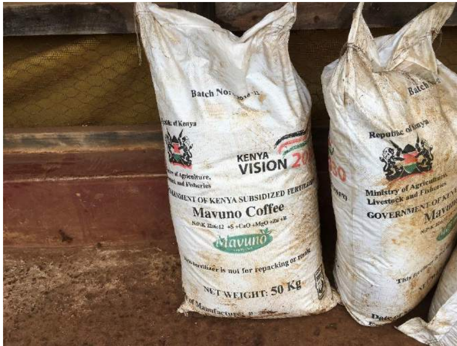
Ministry of Agriculture, Livestock and Fisheries subsidized fertilizer